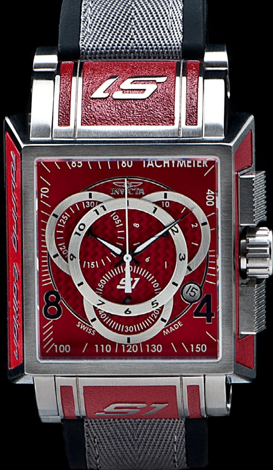
The Invicta S1 Touring Edition Swiss Chrono

The S1 Rally is waiting to be taken out for a serious spin. At Invicta we know to cruise in the fast lane means to live in a world where a moment in time can determine ultimate glory. Look no further than an S1 timepiece to mark each second with precise perfection. This fully developed racing series is emboldened by features including Swiss movements, stainless steel casing, colored hands and textured dials. The deft S1 Rally will clock life's mileage both off and on the track.