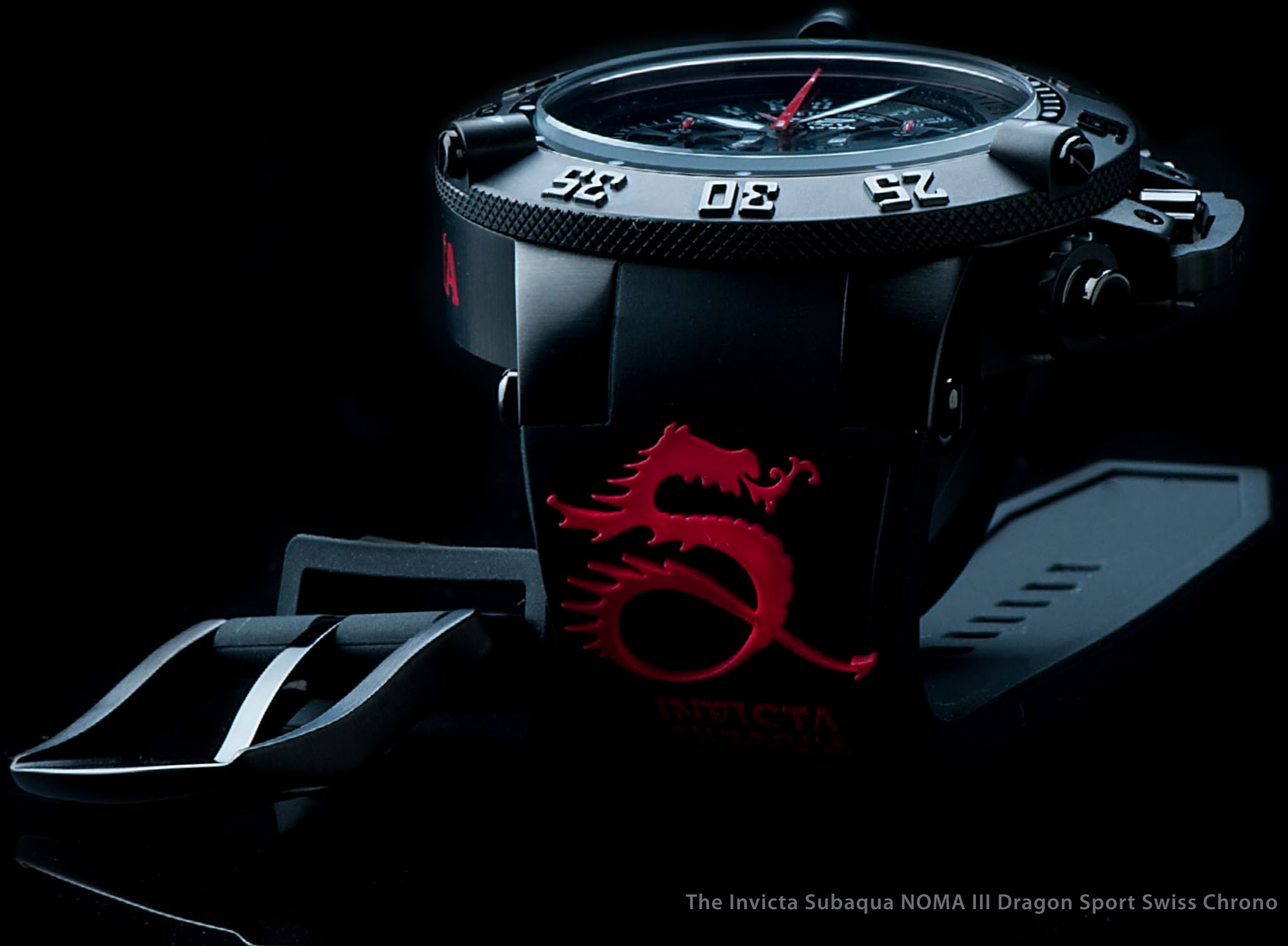
The Invicta Subaqua NOMA III Dragon Sport Swiss Chrono