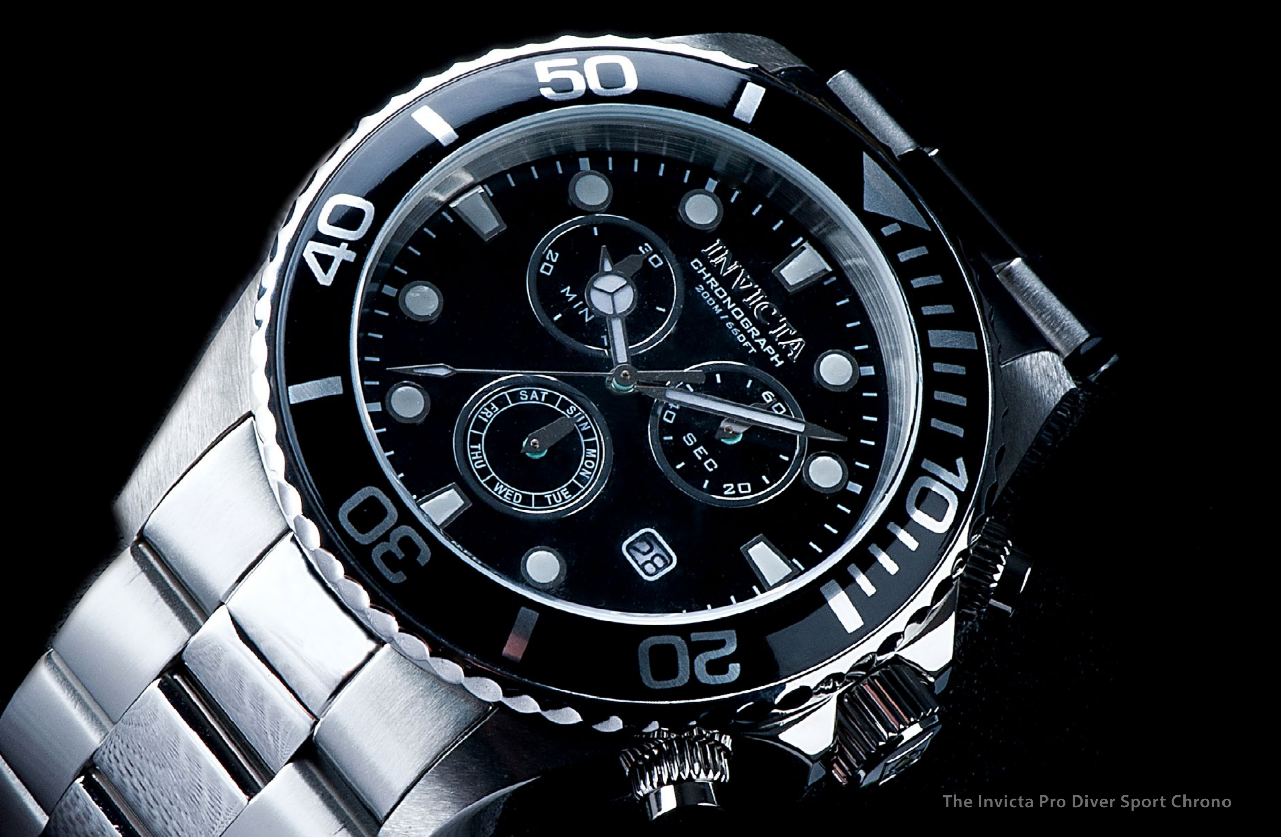
The Invicta Pro Diver Sport Chrono