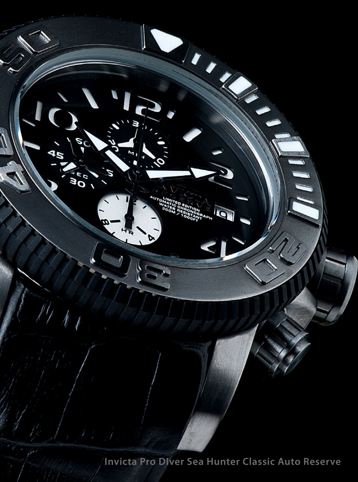
Invicta Pro Diver Sea Hunter Classic Auto Reserve

A new masterpiece in timing has joined the ranks of the Pro Diver collection: the Invicta Sea Hunter. Prominently sized and ready to face depths up to 300 meters, the Invicta Sea Hunter arrives with a visionary purpose prepared to handle any level of intensity. Emboldened by Swiss-Made technical systems geared for the ultimate time mobility and function. Not for the faint of heart, the fierce volume and capability of the Sea Hunter pushes past barriers, delivering an unparalleled standard.