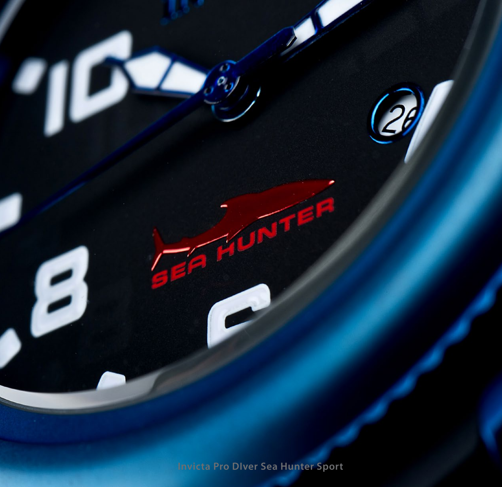
Invicta Pro Diver Sea Hunter Sport