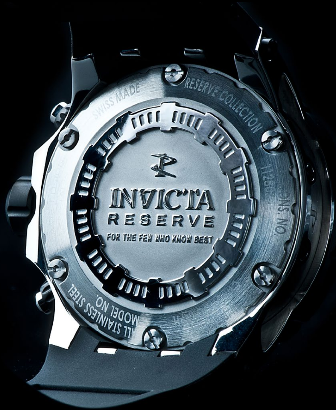
The Invicta Reserve Scuba Swiss Chrono