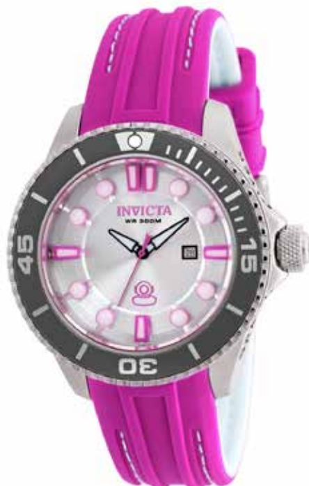
MAY The Invicta Pro Diver Model 20208