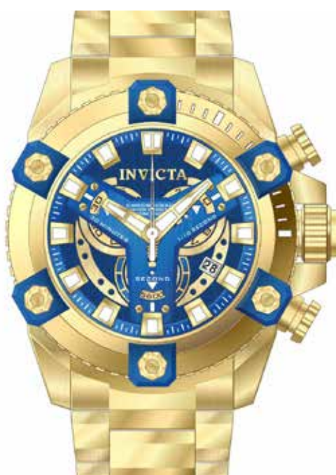
NOVEMBER The Invicta Coalition Force Grand Octane Model 19582