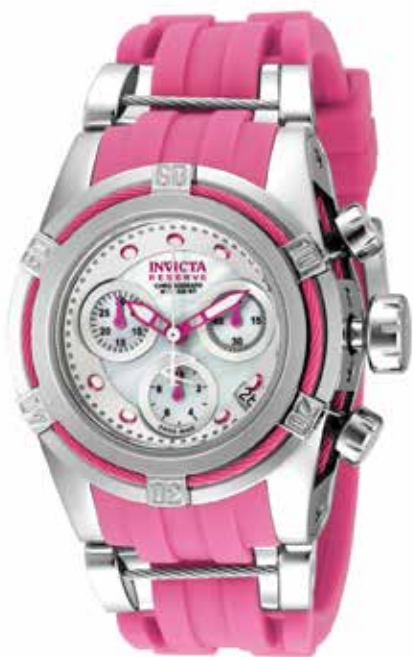
OCTOBER The Invicta Lady Bolt Model 18682