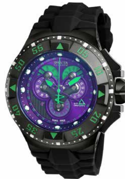
MARCH The Invicta Reserve Excursion Model 18563