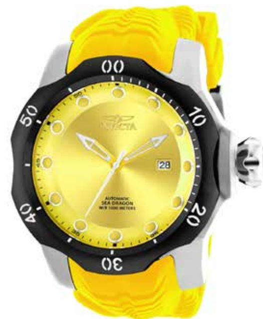
JUNE The Invicta Venom Sea Dragon Model 19301