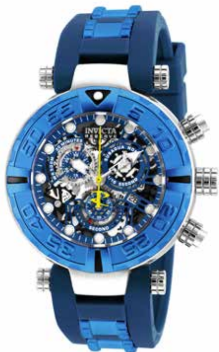
APRIL The Invicta Subaqua Noma I Model 19588