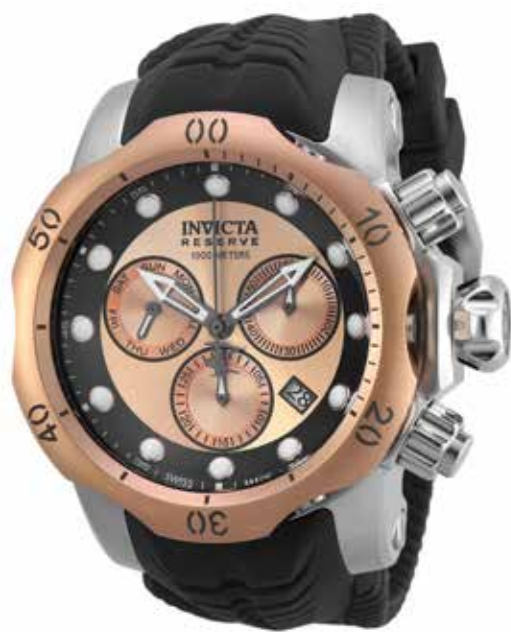
JULY The Invicta Venom Model 19921