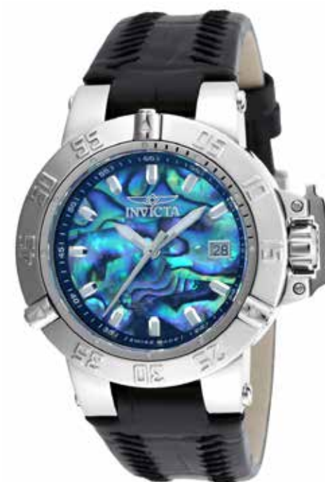
DECEMBER The Invicta Subaqua Noma III Model 19890