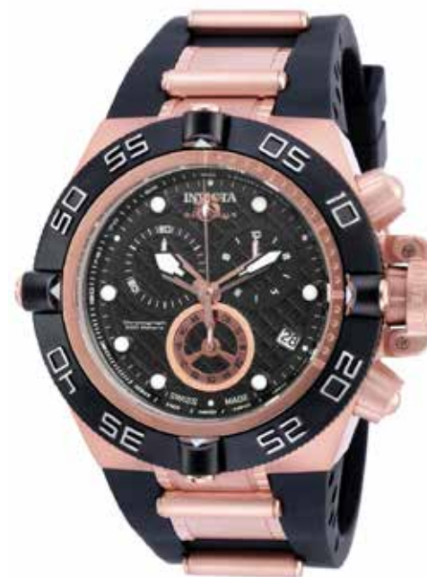
SEPTEMBER The Invicta Subaqua Noma IV Model 16146