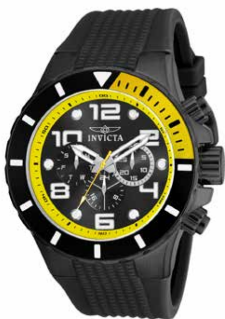
FEBRUARY The Invicta Pro Diver Model 18741