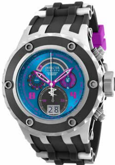
AUGUST The Invicta Reserve Specialty Subaqua Model 16252