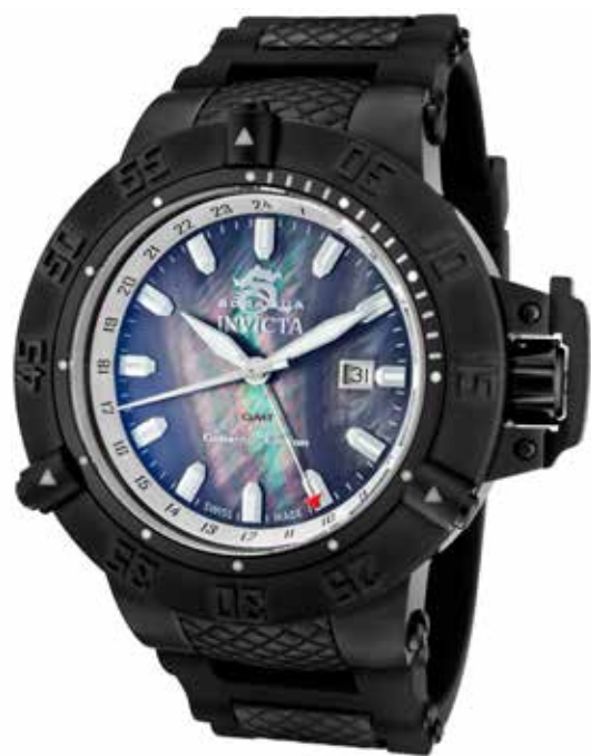
JANUARY The Invicta Subaqua NOMA III Model 0736