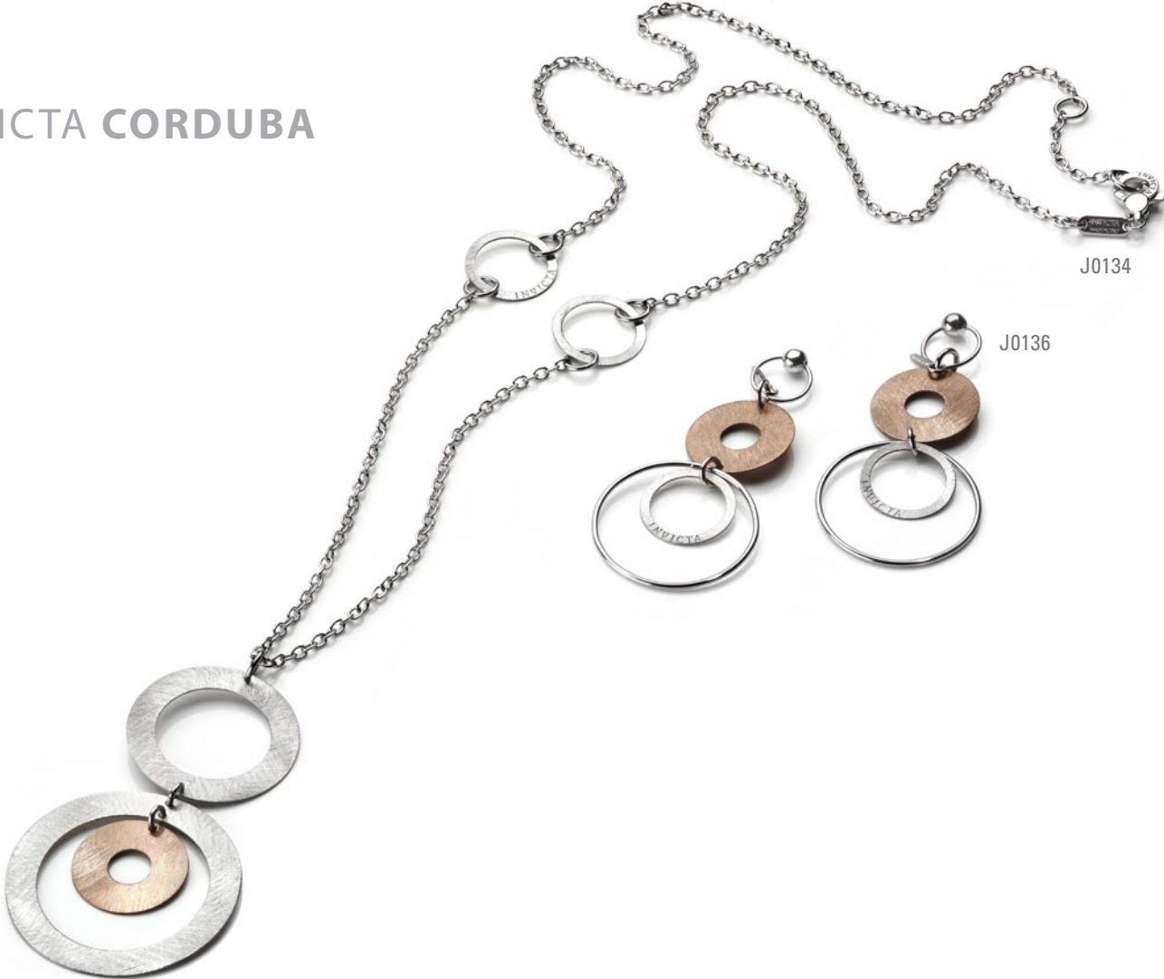
Earrings: Silver 925. Acrylic Resin. 18K gold plating. Necklace: Silver 925. Acrylic Resin. 18K gold plating. 24K gold plating on clasp. 80cm long.