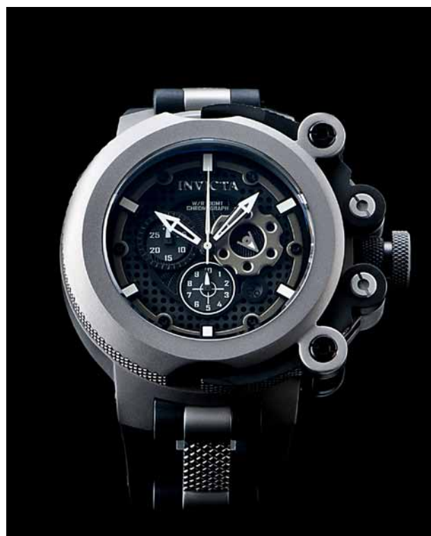
The Invicta Coalition Forces Trigger Chrono Model 0956