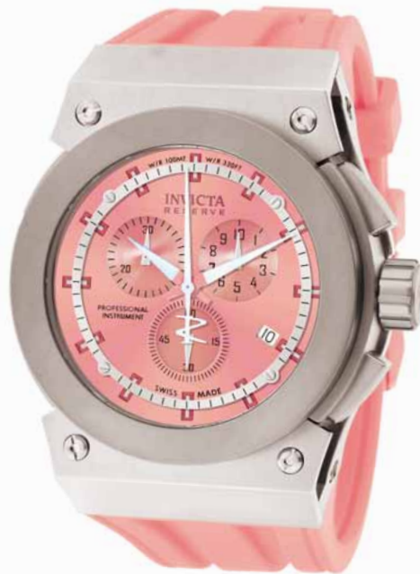
The Invicta Akula Classic Swiss Chrono Reserve Model 1359