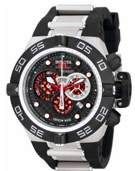
The Invicta Subaqua NOMA IV Swiss Chrono Model 6569