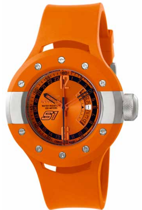
The Invicta S1 Classic Swiss GMT Model 1362