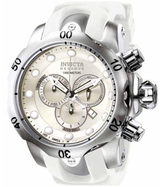
The Invicta Venom Classic Swiss Chrono Reserve Model 1408