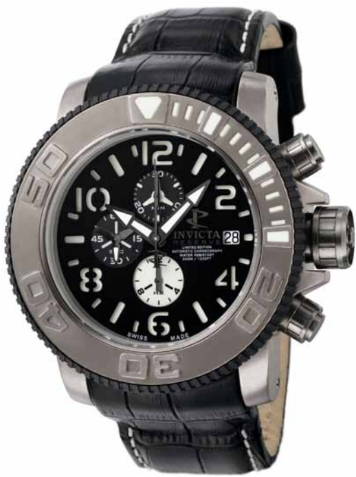
The Invicta Pro Diver Sea Hunter Auto Reserve Model 0602