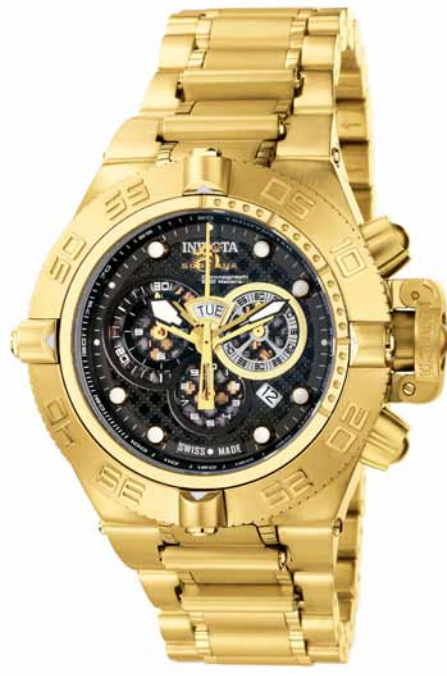
The Invicta Subaqua NOMA IV Swiss Chrono Model 6553