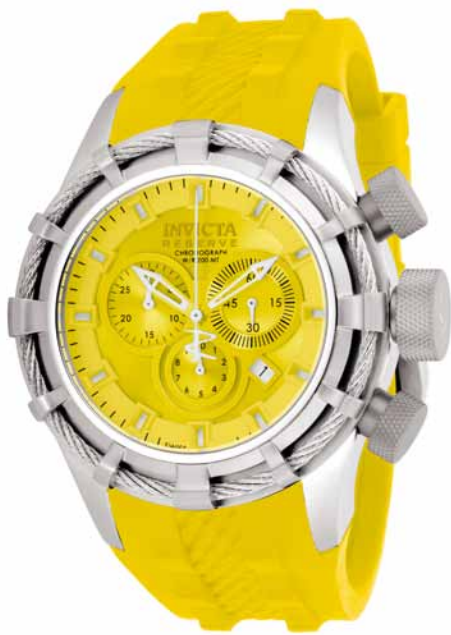
The Invicta Bolt Classic Swiss Chrono Reserve Model 1369