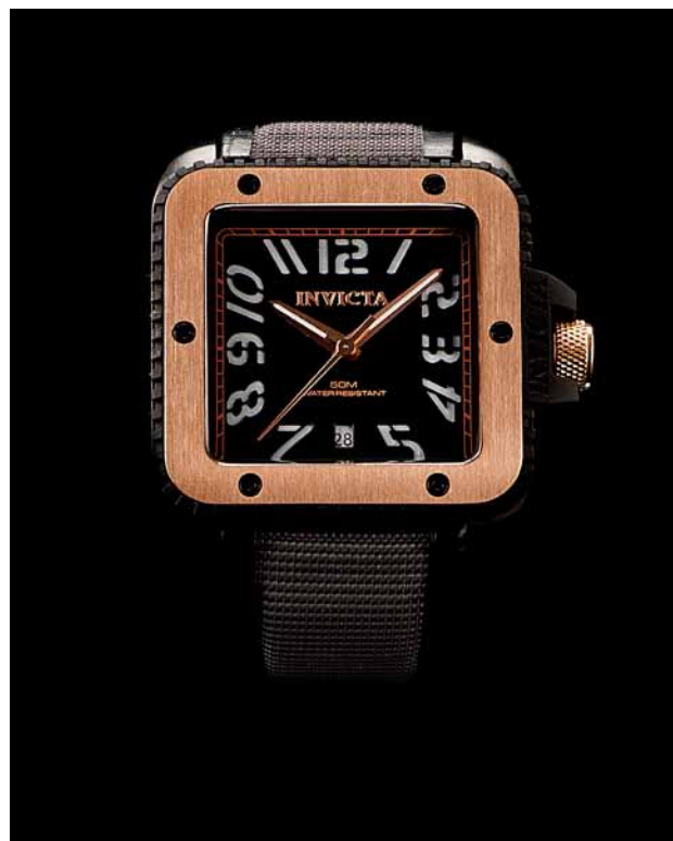
The Invicta Cuadro Primo Model 1458