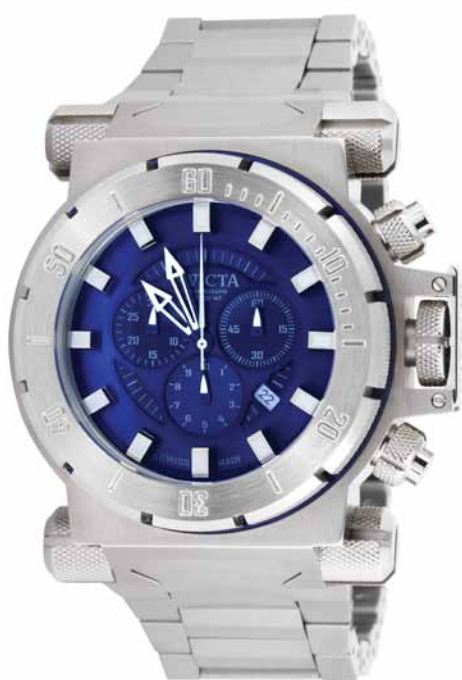
The Invicta Coalition Forces Classic Swiss Chrono Model 1939